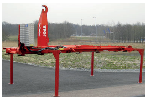
Cameleont - hook lift.