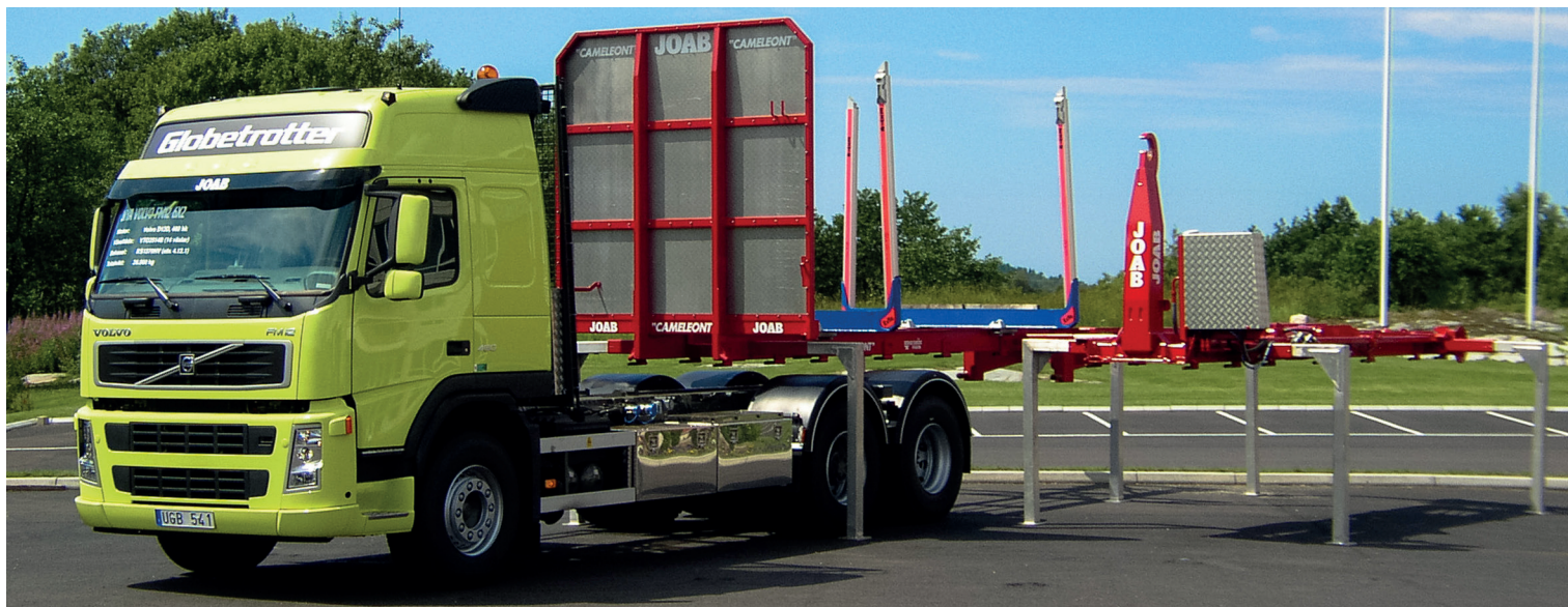
Swap system change.