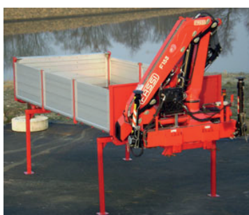
Cameleont - crane body.