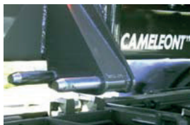
Twin stud mounting for crane bodies