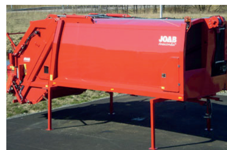
Cameleont - refuse collection body.

JOAB Försäljnings AB Östergärde Industriväg 50 417 29 Gothenburg, Sweden Phone: +46 (0)31 705 06 00 info@joab.se