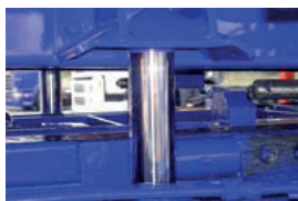
Large guide channels